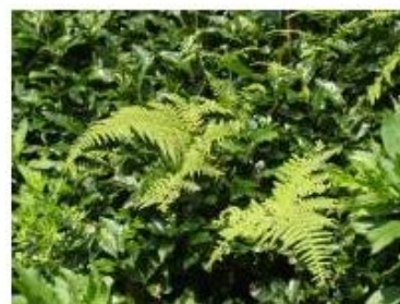
A type of fern