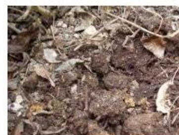
Soil of gyokuro tea farm managed well