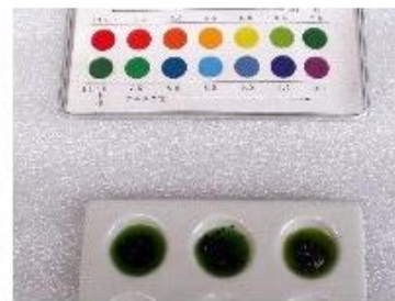
You can tell that a well-managed tea farm's soil has a neutral pH. Though tea trees are generally tolerant to acidic soil, neutral soil is more desirable.