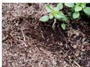
Soil of organic tea farm managed well

Below pictures were taken at three types of tea farms (organic tea farm, non-organic gyokuro and sencha tea farms) when we inspected the pH of each tea farm. You will tell the difference of softness from each soil.