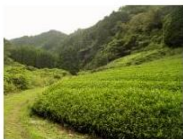
Organic tea farm surrounded by rolling hills

And as above, organic fertilizer works slowly. So, organic tea trees are more of a burden than non-organic tea trees. To put it the other way around, chemical fertilizer in non-organic tea farms makes the growing process much more easy. From the perspective of modern cultivation, it can be said that it produced considerable improvement of traditional cultivation and brought the tea industry amazingly high productivity. It is definitely one of the contributions of modern agriculture.