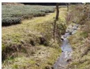
Brooks run in and around our tea farms helping to create mist in the morning, which is necessary for growing high quality tea.