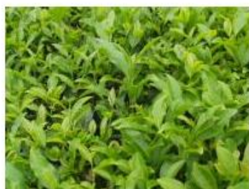
Non organic tea farm in July