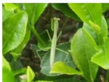
Mantis on the organic tea farm