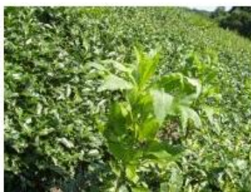
Felon herbs at the tea farm