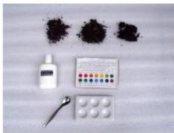
Inspecting pH of each tea farm