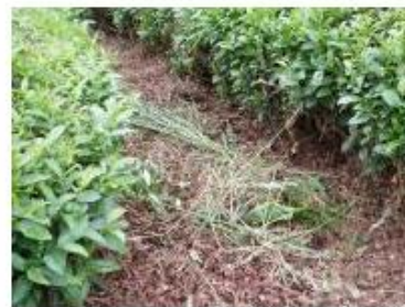
Rooted up weeds