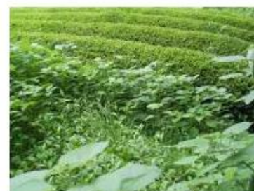
Rampant weeds growing close together