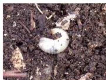
Embryo of beetle in soil at organic tea farm