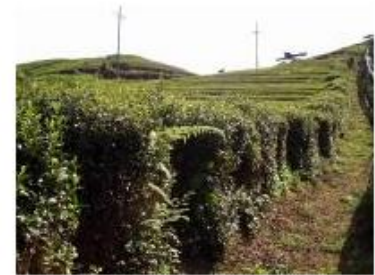
Tea trees of the end of the organic tea farm are lengthened, to prevent pesticide interfusion. It is a Shelterbelt.