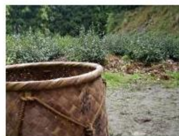
Many of our tea farms have ideally calcareous earth. Fossils used to be dug up near our tea farms.