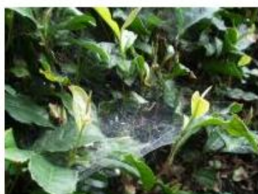
Spider's web among the tea trees on the organic tea farm