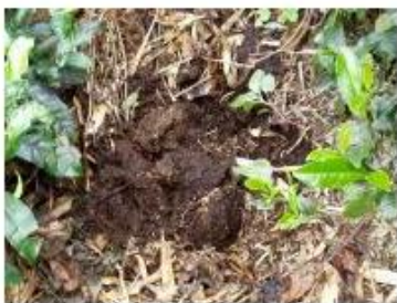
Soil of sencha tea farm managed well