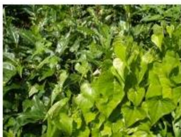
The right side of the picture is the foliage of the vines entwining with the tea trees.

Not only is weeding in summer the hardest work, but it is also the most expensive work. Modern non-organic cultivation needs little weeding, so much less than organic cultivation, and in general takes less time. From the perspective of modern cultivation, it can be said that it produced considerable improvement of traditional cultivation and brought the tea industry amazingly high productivity. It is definitely one of the contributions of modern agriculture.