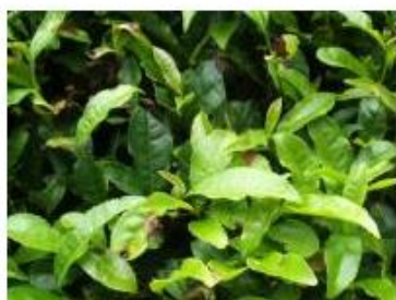
Tea farm having been changing to organic in July

tea farm tries to control the ecosystem. Meanwhile you will realize the advancement and the economic efficiency of modern cultivation.