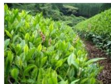
Organic tea farm on which tea leaves don't eaten by harmful insects.