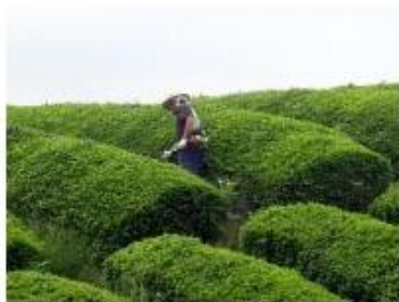
Cutting weeds by machine