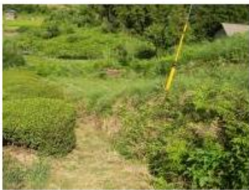
Buffer zone to separate organic tea farm and non-organic

Today the vast majority of tea is non-organic, also known as conventionally-grown. Only a small percentage (much less than one percent of all tea) is organic. It is difficult just to make an organic tea farm because there are so many non-organic tea farms around it. Dispersals of chemical fertilizer or pesticide and chemical agents interfused through the soil from surrounding farms can enter the organic farm. Therefore it is necessary to make a buffer zone or shelterbelt between an organic tea farm and non-organic tea farm or to embrace organic tea cultivation together with the neighboring farmers.