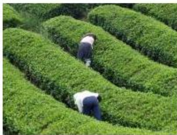
Rooting up weeds around the tea tree by hand